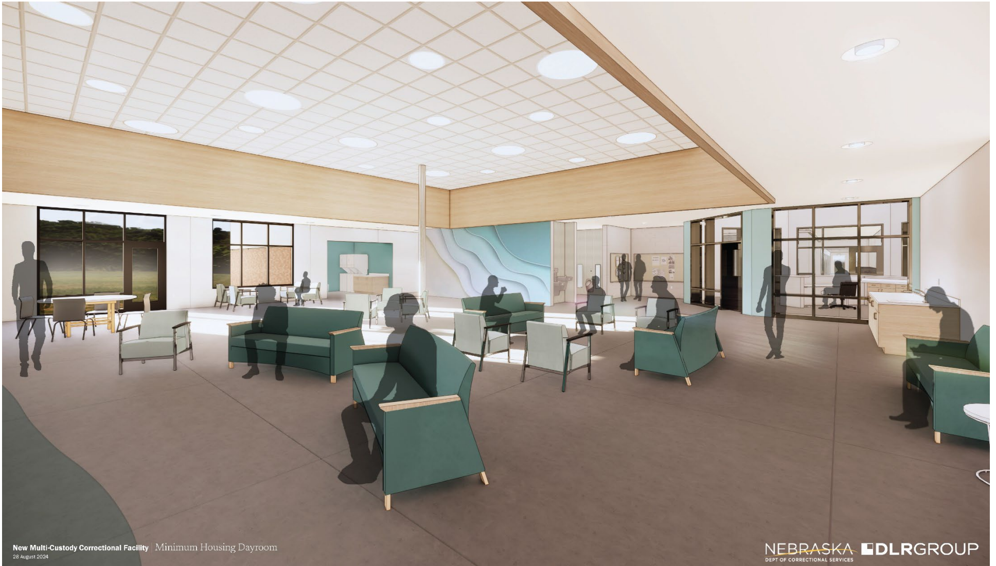
Minimum Housing Day Room