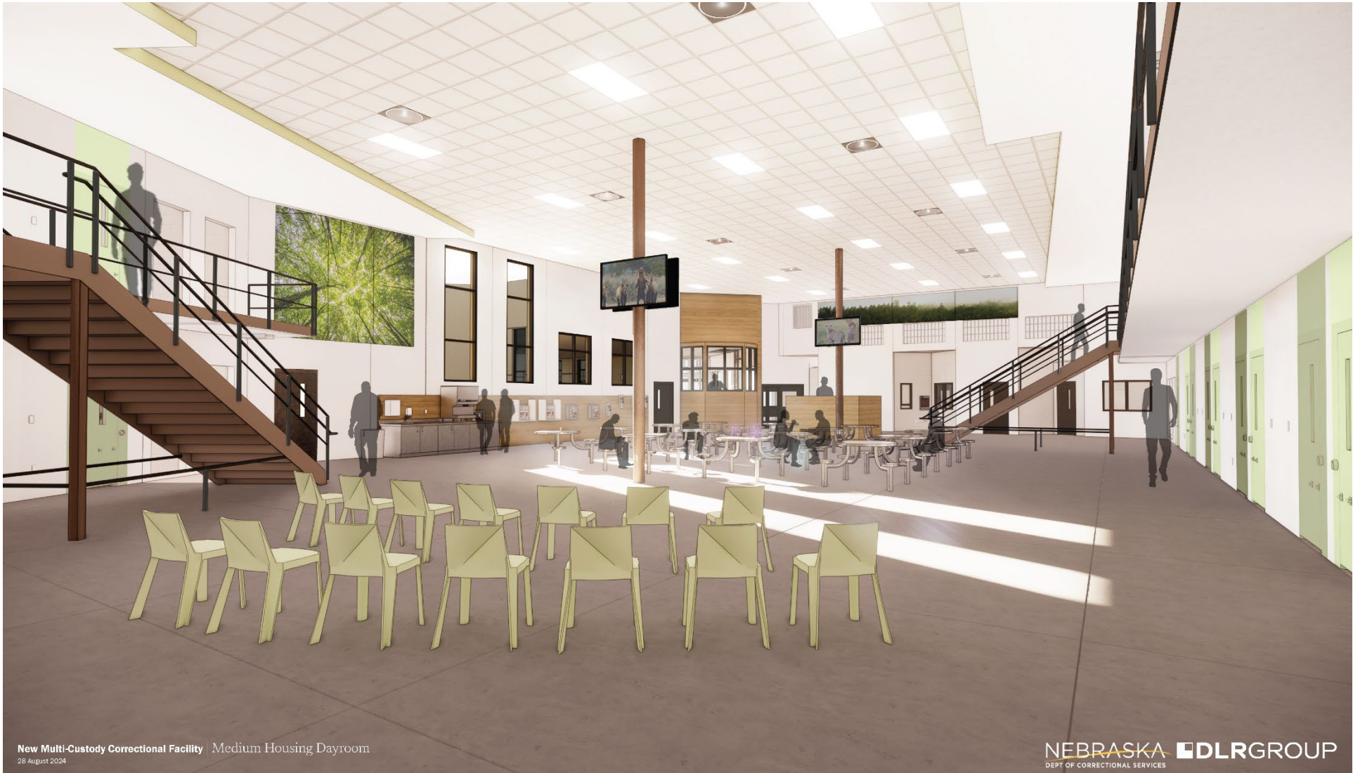
Medium Housing Dayroom