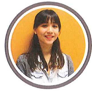
Zitlali Sage Computer Classes, Volunteer