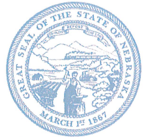
Jim Pillen, Governor